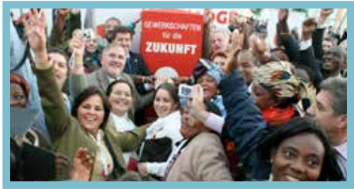
IGB-Gründungskongress in Wien, 2006 ITUC Congress in Vienna, 2006 Congrès du CIS à Vienne, 2006

Now that Austria has joined the European Union and its economy has opened itself up to neo-liberal globalization, we are faced with new major challenges. The right response can only be a truly global dialog as well as stepped-up international cooperation with trade unions. Therefore, the ÖGB embraces the following international agenda: