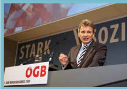
ÖGB-Präsident Erich Foglar beim Bundeskongress 2009 ÖGB President Erich Foglar at the 2009 National Congress Le président de l'ÖGB Erich Foglar lors du Congrès fédéral en 2009

The supreme decision-making body in between National Congresses is the National Executive Board, consisting of Presidium members, representatives of unions and of the ÖGB's women's, youth, and pensioners' departments.