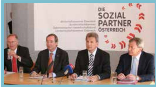
Dialog der Sozialpartner Social Partnership dialogue Dialogue des Partenaires Sociaux

Economic and social partnership" is a typical Austrian institution. It refers to the voluntary and informal cooperation of employers' and employees' associations in economic and social policy with a view to striking a compromise that both sides can live with. Essentially, it is a bipartite system which, if need be, may also contain tripartite elements (by involving the government).