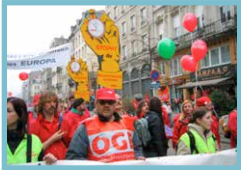
Teilnahme an EGB-Demonstration in Brüssel, 2005. Participating in ETUC rally in Brussels, 2005. Participation à la manifestation du CES à Bruxelles, 2005.

Ultimately, peace and security can be achieved globally only when we manage to sustainably improve living conditions. The ÖGB therefore also advocates disarmament of nuclear and conventional weapons and a peace-focused foreign policy by Austria based on a proactive policy of neutrality.