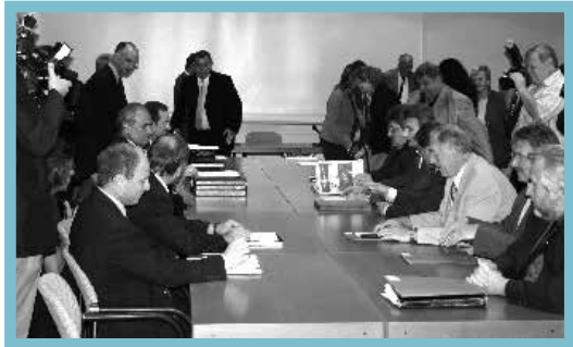
Start der Metallerlohnrunde, 2006. Beginning of collective bargaining in the metal sector, 2006. Négociations des salaires des travailleurs métallurgiques, 2006.

As part of its collective bargaining mandate, unions within the ÖGB conclude more than 500 agreements annually. These are applicable to all companies and all workers employed in a particular industry (not just union members). According to the OECD, Austria has a collective agreement coverage of more than 95%, which has contributed to considerable income security for those employed and a level competitive playing field for companies – a unique feature of the Austrian system. In addition to achieving satisfactory income levels that reflect economic development and rising prices, the ÖGB through its collective bargaining policy aims to create a positive legal framework for workers.