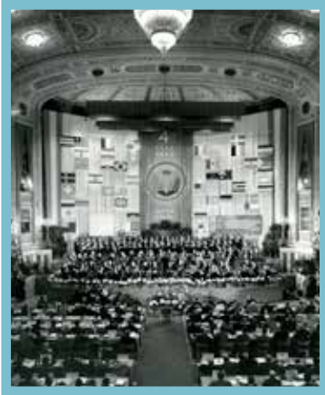
IBFG-Kongress in Wien, 1955. ICFTU Congress in Vienna, 1955. Congrès du CISL à Vienne, 1955.

From the vantage point of a trade union that comes from a small country heavily impacted by economic developments occurring at European and global levels, international cooperation has always been crucial. Hence, the ÖGB's international ties are highly diverse.