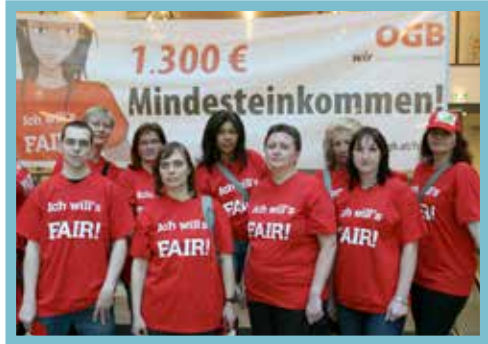
ÖGB-Aktion für höheren Mindestlohn ÖGB campaign for higher minimum wages Action de l'ÖGB pour une augmentation du salaire minimum

Traditionally, Austrians prefer consensus and negotiated solutions. As evidenced by our strike statistics, Austria is a country with very few walkouts. An exception to this rule was 2003. The ÖGB mobilized about one million people on June 3 throughout Austria to demonstrate against the pension reform planned by the government. The industrial action was a success: the government was forced to back-track from the proposed piece of legislation and incorporate numerous changes in the new law.