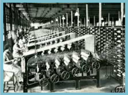
Schwieriger Beginn ... A difficult beginning ... Des débuts difficiles ...

The first trade unions had a distinctly local organizational setup. It was only in the late 19th century that a union organization reaching across industries and regions gained widespread acceptance. Thanks to their strength, the unions successfully fought for fundamental social rights, such as a ban on Sunday work, the introduction of health and accident insurance, ten-hour